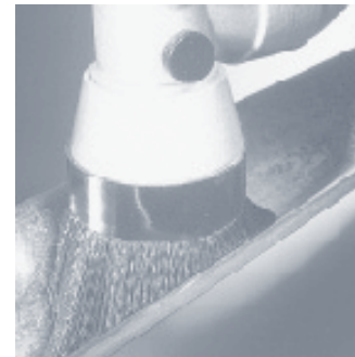
Vacuum head sealing