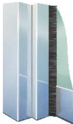
Elevator Guard reduces the risk of finger entrapment on elevator doors.