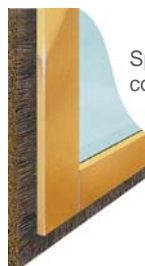
Specially trimmed corner sections

Sealing kits comprises top, bottom, side and corner sections for each door panel. Brushstrip are available in hardwearing horsehair or nylon fill, trimmed to suit the door clearance