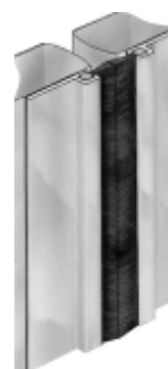
Self adhesive backed seals for the centre of swing glass doors

Brushstrip seals are available to suit all sizes of hinged and sliding glass entrance doors. Supplied in standard lengths or cut and finished to your requirements.