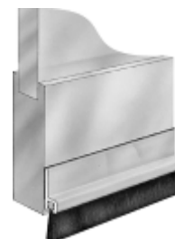
Threshold seals for swing and sliding glass doors