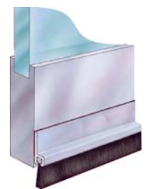
Threshold seals for swing and sliding glass doors