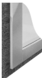
Specially trimmed corner sections

Sealing kits comprises top, bottom, side and corner sections for each door panel. Brushstrip are available in hardwearing horsehair or nylon fill, trimmed to suit the door clearance