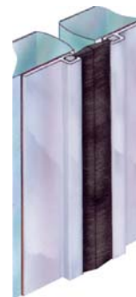
Self adhesive backed seals for the centre of swing glass doors

Brushstrip seals are available to suit all sizes of hinged and sliding glass entrance doors. Supplied in standard lengths or cut and finished to your requirements.